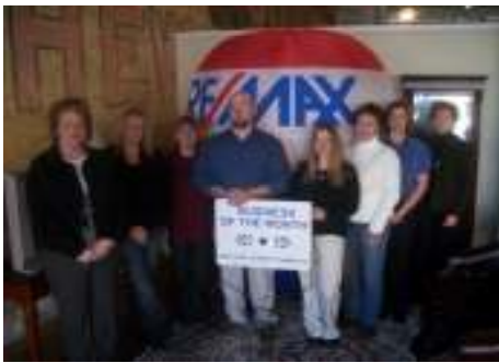
Business of the Month RE/MAX

The Community Pride Committee selected the following for the month of February: