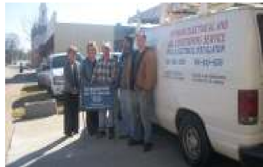
Entrepreneur of the Month Seymour Electrical & Air Conditioning Service, Inc.

Congratulations to these Chamber members.